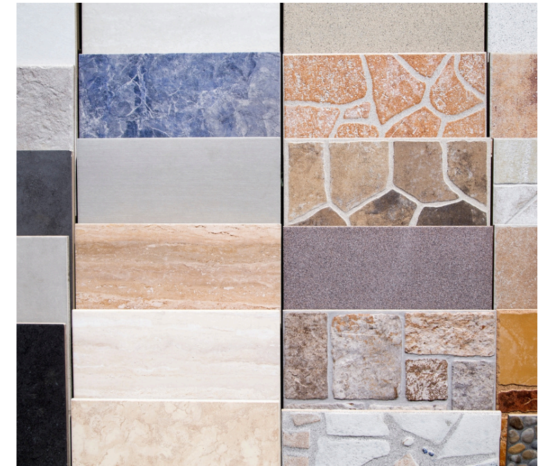
Tile and Ceramic